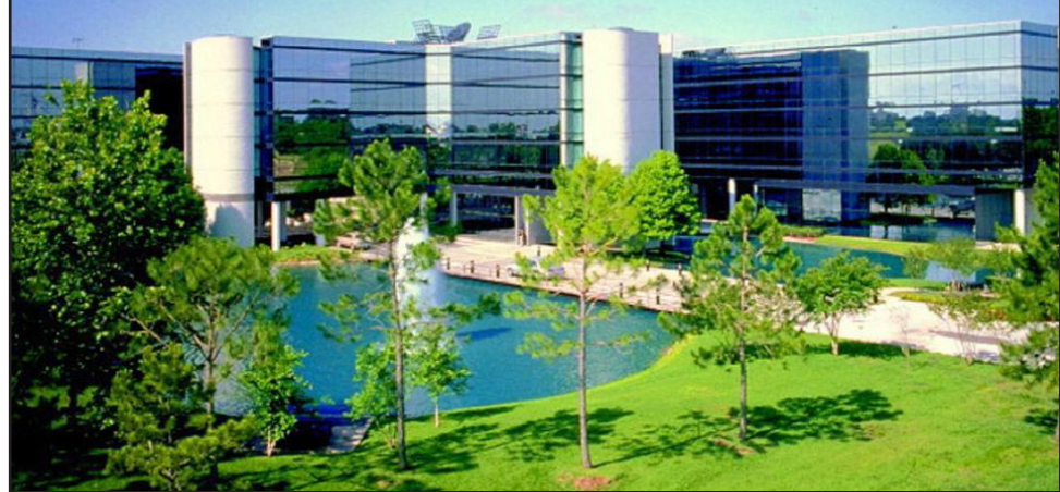
The Omni Houston Westside will once again be the host for the annual convention of the Texas Speech Convention Association.